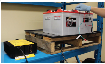
Figure 7: Touch the positive lead to the positive battery terminal for 3 seconds.