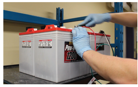
Figure 8: Reattach the positive lead to the positive terminal after disconnecting AC power.